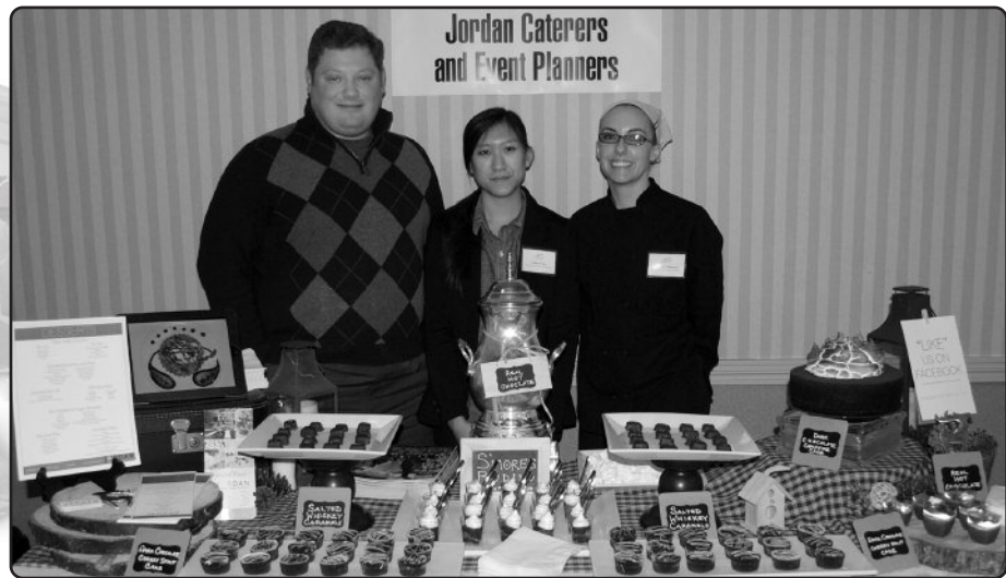
Newcomers Jordan Caterers took home 3 of 4 awards for their "Campfire Delight" (decadent drinking chocolate; dark chocolate budino, with graham cracker and bourbon marshmallow cream; sea salted chocolate bourbon caramel bites; and dark chocolate cherry stout cake).

E ight restaurants, six judges, and over 200 friends came out to make this year's Chocolate to the Rescue a huge success. Our gratitude goes out to all who helped raise nearly $23,000 for our Middlesex Family Shelter!