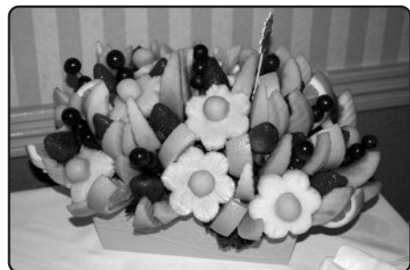
Our Title Sponsor, Edible Arrangements, brought their signature fresh fruit bouquets to our 11th Annual Chocolate to the Rescue!

Chocolate to the Rescue directly helps families in housing crisis. In just over two months in 2013, our 7-unit Middlesex Family Shelter has already assisted 10 families, including 15 children. One family of a mother with two children came to our shelter after going through a divorce and losing her job. Unable to pay rent, she faced a painful eviction. We are happy to say that this mom has risen from these difficult circumstances and is now employed and on the road to regaining stable housing for herself and her children. Success stories like this are only possible because of the help of our generous supporters. ■