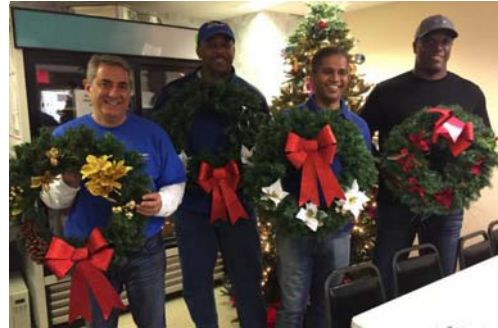
Webster Bank Community banking executives (not all pictured) spent a day decorating our Wallingford Emergency Shelter for the holidays. They supplied the decor, shopped for the children staying in the family units, wrapped the gifts, and provided a meal as well!

Without your support, our work to provide lifesaving shelter, housing, and services for people who are homeless or at-risk of becoming homeless would not be possible. Thank you to all who gave financial contributions during our Homeless for the Holidays campaign, raising over $160,000 to continue our mission to end homelessness for every person we encounter. Your gift, in any amount, at anytime, makes an impact. You can still make your gift today.