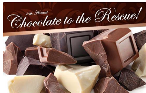
Support our family shelter on March 26th

You can help families experiencing homelessness while enjoying the region's finest chocolate at our 15th Annual Chocolate to the Rescue! Sample mouthwatering chocolate delicacies from local restaurants, bakeries, caterers, and chocolatiers; observe judging from a panel of culinary experts; bid on an array of silent auction items; and vote for your