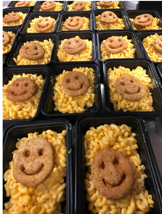
Photo: Just a few of the hundreds of weekly meals – most made with food and funds you donate – prepared by our kitchen staff of two.

Your continuing support keeps our neighbors safe from COVID-19 and the cold weather. Almost 400 people have moved into affordable apartments since mid-March. Those staying in the New Haven shelter moved back to the hotels, and we were able to attain additional beds to keep up to 152 clients safe – close to the same number of people we usually serve during the harsh winters in New Haven. The Wallingford Emergency Shelter (WES) for single adults and the Middletown Warming Center (MWC) are operating at The Wesley Inn & Suites in Middletown, with room for eight WES and 25 MWC clients. Meals and case management services are being provided. Because of you, they are safe not only from the virus but are also safe from the dangerous storm expected to hit CT tonight. Thank you for making an impact on those experiencing homelessness.