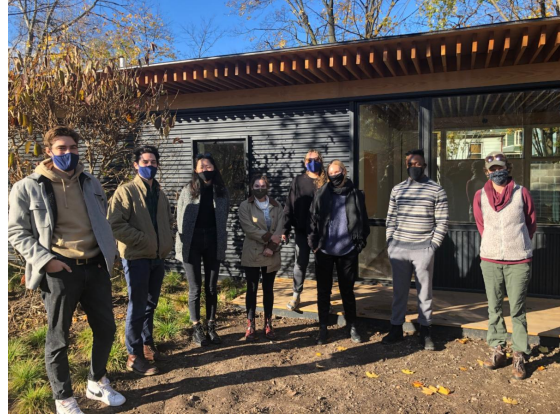
Yale School of Architecture students in front of the building constructed specifically for people experiencing homelessness

able to finish construction safely during the pandemic, but we have not yet been able to share the new housing units with you. We are planning a virtual tour in January to showcase the two one-bedroom units and will keep you posted. The fifth and final building in the initiative will consist of a two-bedroom owner-occupied house with a Veteran preference. With the completion of this final home, Columbus House will have created 10 brand new units of affordable housing for those who were formerly staying in the shelter or living on the streets.