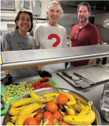
Orange Congregational Church in our New Haven Shelter kitchen.

As the weather heats up, many of us are reaching for sunscreen and cold drinks – but for those experiencing homelessness, summer brings real challenges. Can you give us a hand gathering warm-weather essentials?