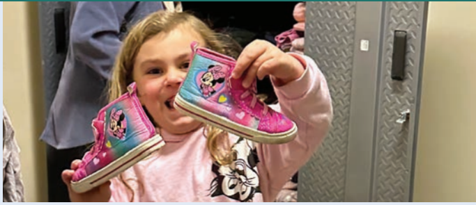
A staff member's daughter helped get our Family Triage Center ready with supplies just before it opened in December.

From December 2 through May 4, Columbus House transformed a warehouse into a temporary shelter for families facing homelessness. Donations of food and necessities, like children's clothing, diapers, and hygiene items, from supporters played a critical role in creating the Family Triage Center. In five months, the center served 56 families – 141 people total – including 81 children and 60 adults.