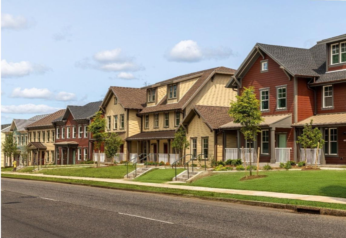
Curtis Cofield Estates in New Haven.